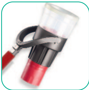
SOLO 330 Smoke Tester