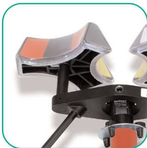
SOLO 200 Removal Tool