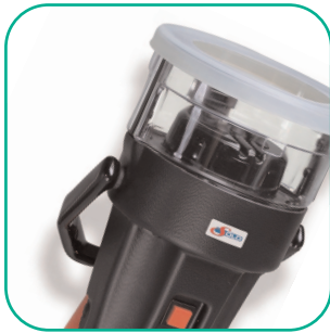
SOLO 461 Cordless Heat Tester