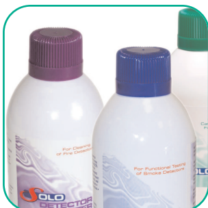
SOLO Test Gases

Standards throughout the world dictate that the testing of fire detection systems be carried out in a safe and controlled manner. The Solo range of tools offers a professional solution to these requirements, allowing testing of all makes and types of smoke, heat and CO (Fire) detectors on ceilings up to 9m.