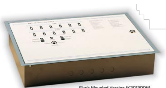
Flush Mounted Version (K3012004)