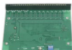
Part No. K580