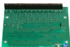
Part No. K461