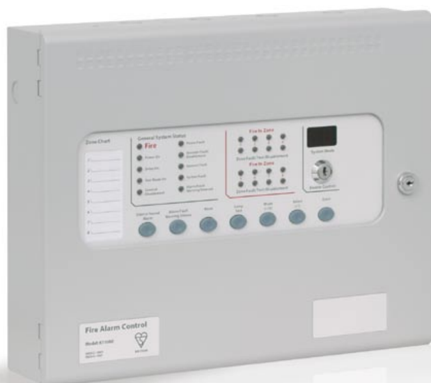
Model No. K11080M2

Note: Also available is the Sigma Sounder Board (K461) which is compatible with all Sigma CP and CP-R panels which have operating software version V3.0 or above. See DS48 (page 77) for more details.